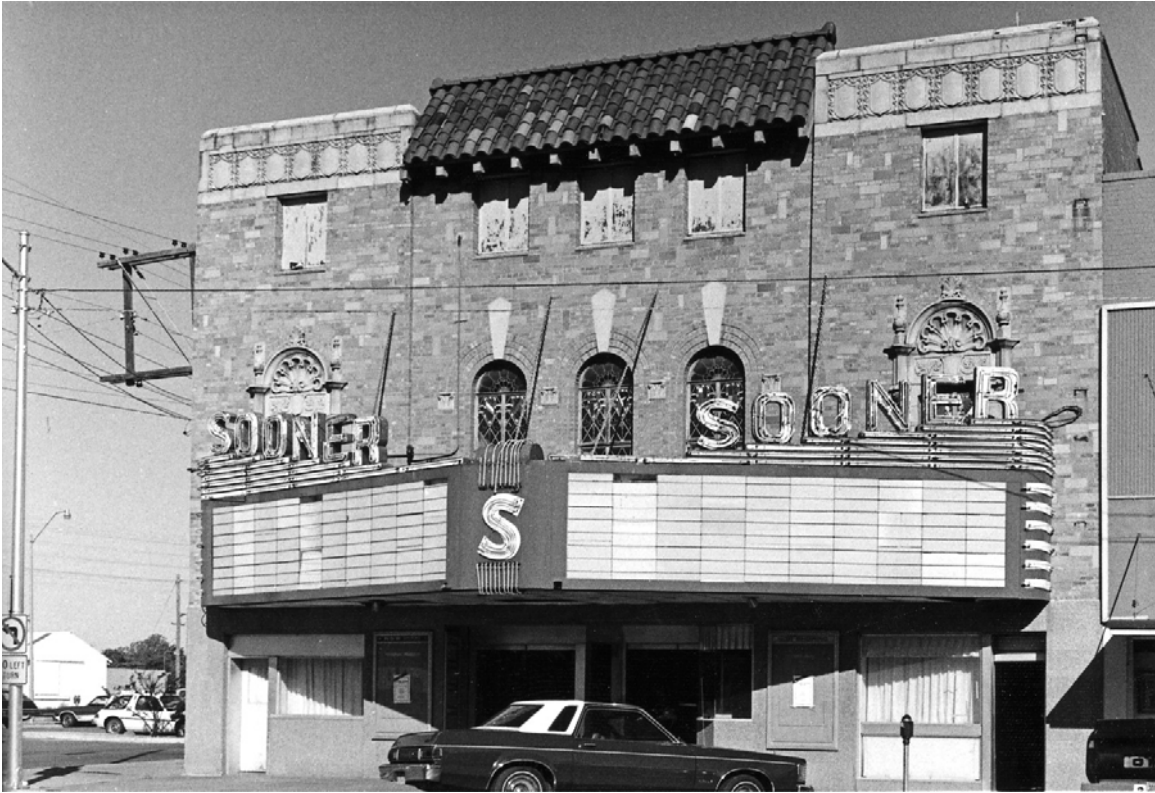
Sooner Theatre Building